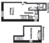
Duplex 1 Bedroom