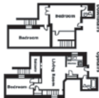
Duplex 3 Bedroom

www.furnishedquarters.com 158 West 27th Street 3rd Floor New York, NY 10001 212.367.9400